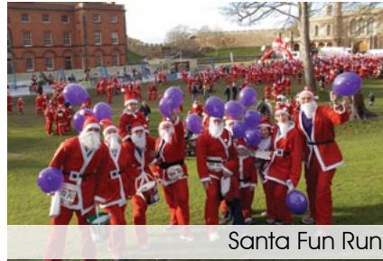
Santa Fun Run

The branding of the Boultham Park Restoration Project, quite naturally, is a design of trees and leaves illustrated on the cover of this brochure and we are currently working with the project design team and graphic designer, to finalise our acknowledgement feature to sensitively represent the level of involvement of each of our valued supporters.