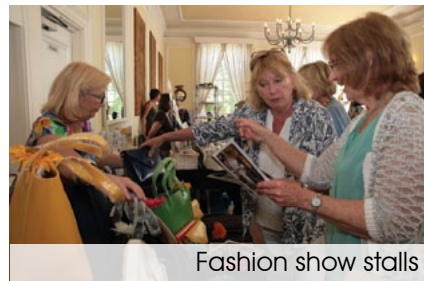
Fashion show stalls