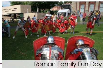
Roman Family Fun Day