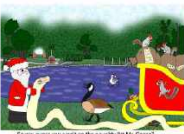
So you swear you aren't on the naughty list Mr. Goese?